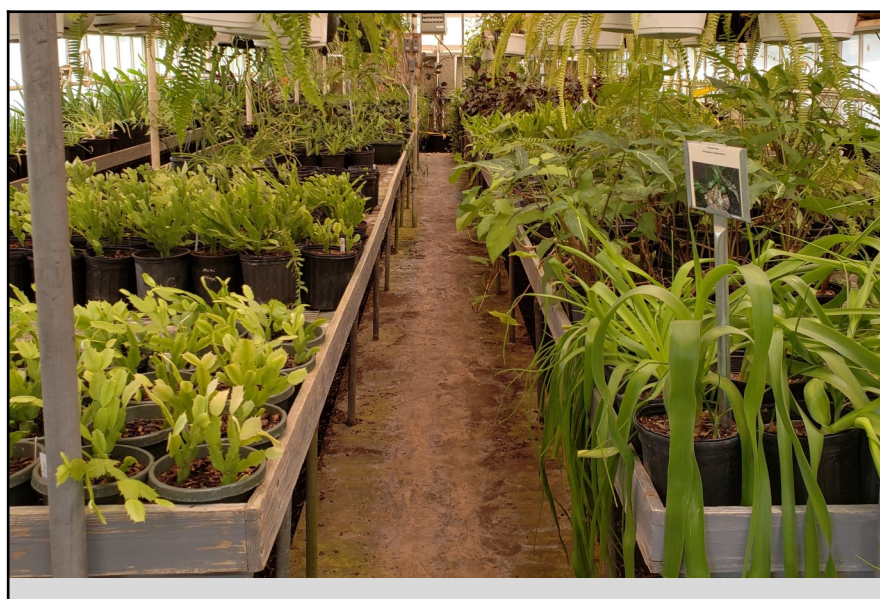
Residents learn horticulture skills while working at the NEFSH "Nature's Touch Greenhouse".

NEFSH will participate in the APPIC computer matching system for intern selection for the coming year. Applicants must register online to participate in the Match. You can register at: <a href="https://www.natmatch.com/psychint">www.natmatch.com/psychint</a>. Notification of your final status relative to this internship will be through the APPIC Matching Service. This internship site agrees to abide by the APPIC Policy that no person at this training facility will solicit, accept, or use any ranking-related information from any intern applicant prior to Match Day.